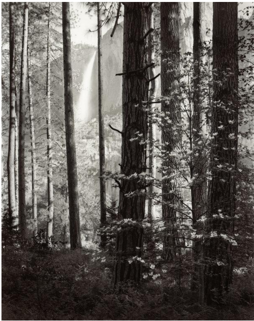
Dogwood and Upper Yosemite Falls, 2024.