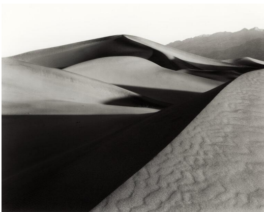
Dunes III , 2025.

20x24" print. 32x36" mount. $1250 unframed. $2600 framed.