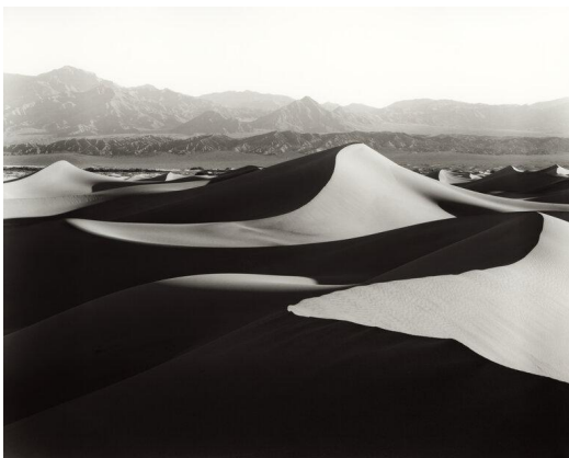
Dunes II , 2025.

20x24" print. 32x36" mount. $1250 unframed. $2600 framed.