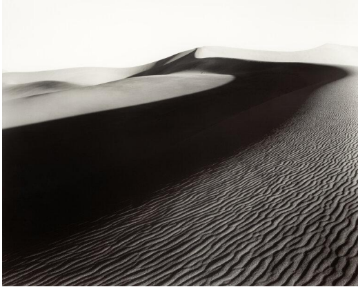
Dunes I , 2025.