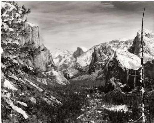
Inspiration Point, Winter, 2025.

20x24" print. 32x36" mount. $1250 unframed. $2600 framed.