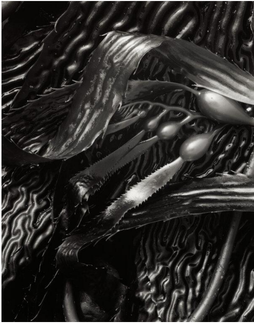
Kelp Study, 2024.