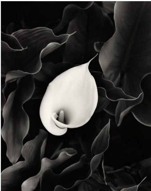
Calla Lily Study I, 2024.

11x14" print. 16x20" mount. $475 unframed. $925 framed.